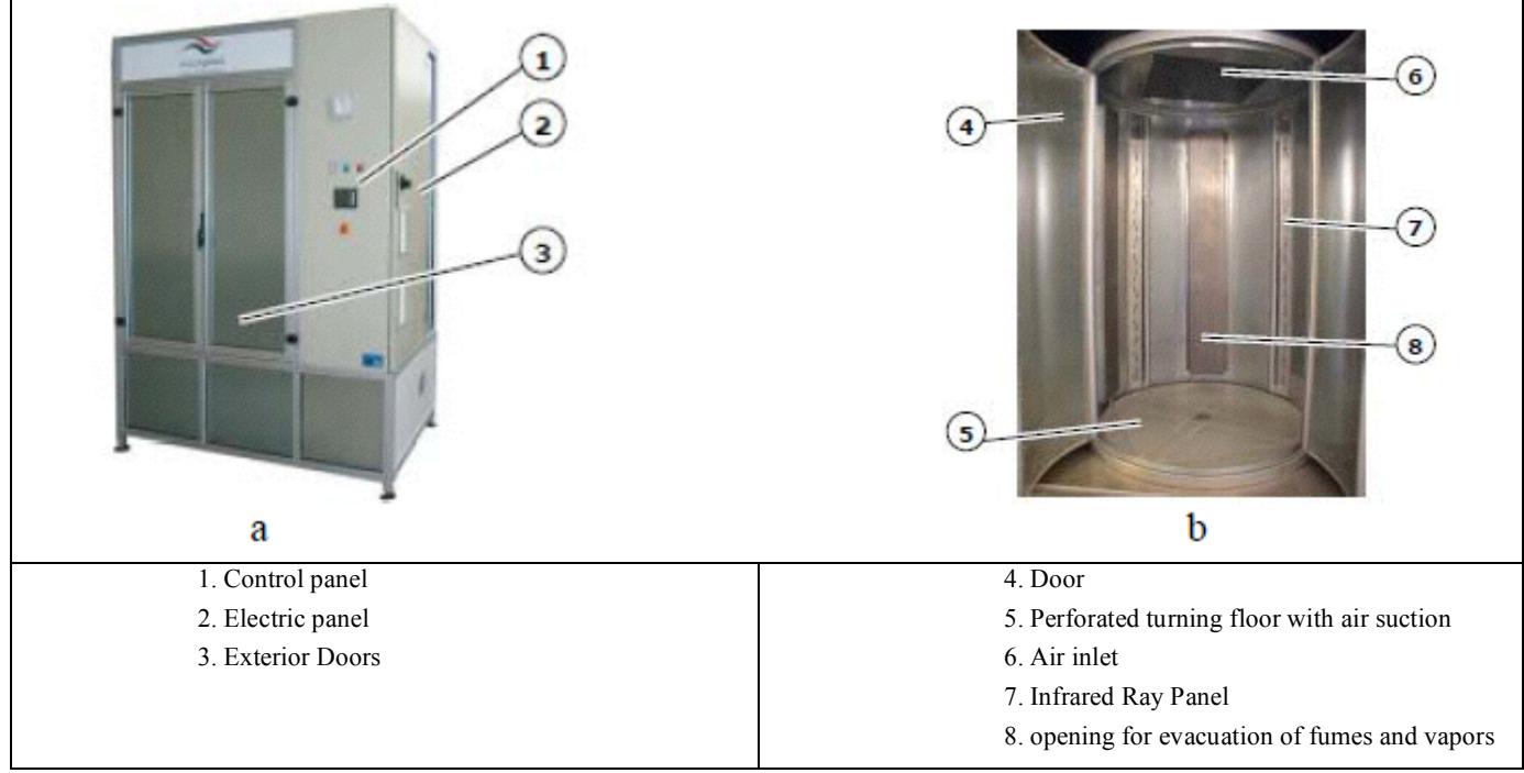
Fig. (1). Drying system: a) external view; b) internal view.