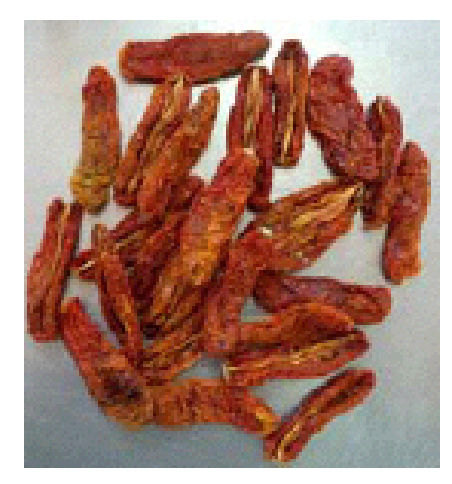
Fig. (4d). "MW+Air 2" cycle.

similar. Dried tomatoes obtained using the cycle "MW" were found to be softest ever. Ultimately, examined quality parameters highlighted that the tomatoes dried by microwave cycle "MW" (4 kW) are of better quality. We report below the frames of dried products (Fig. 4a, b, c, d).