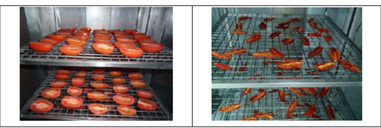
Fig. (2a). Fresh tomatoes inside the plant (2b). Dried tomatoes at the end of the treatment.