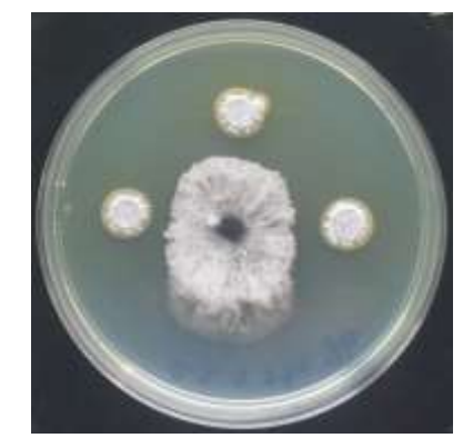
Fig. (1). Streptomyces sp. Str 74 against Cochliobolus sativus (primary screening).