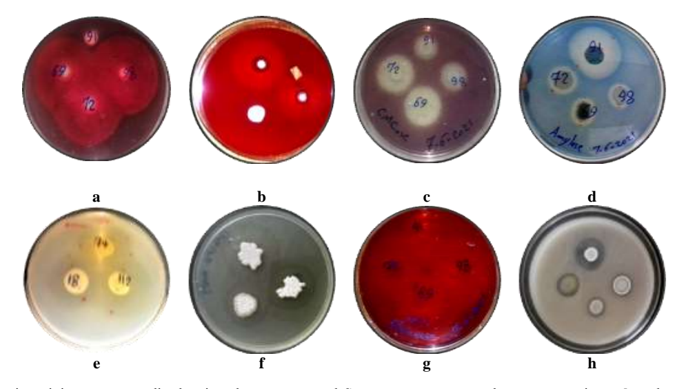
Fig. (4). Enzymatic activity on agar media showing clear zone around Streptomyces spp. growth zone. a: pectinase, b: xylanase, c: CMCase, d: amylase, e: protease, f: lipase, g: glucanase, h: chitinase.