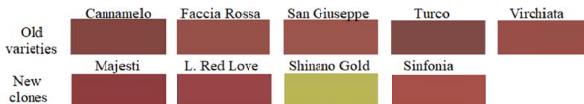
Fig. (1). Colour table obtained from the results of the L*a*b* colour recorded in the CIEL*a*b* colour space and converted to the red/green/blue (RGB) scale through the www.e-paint.co website.